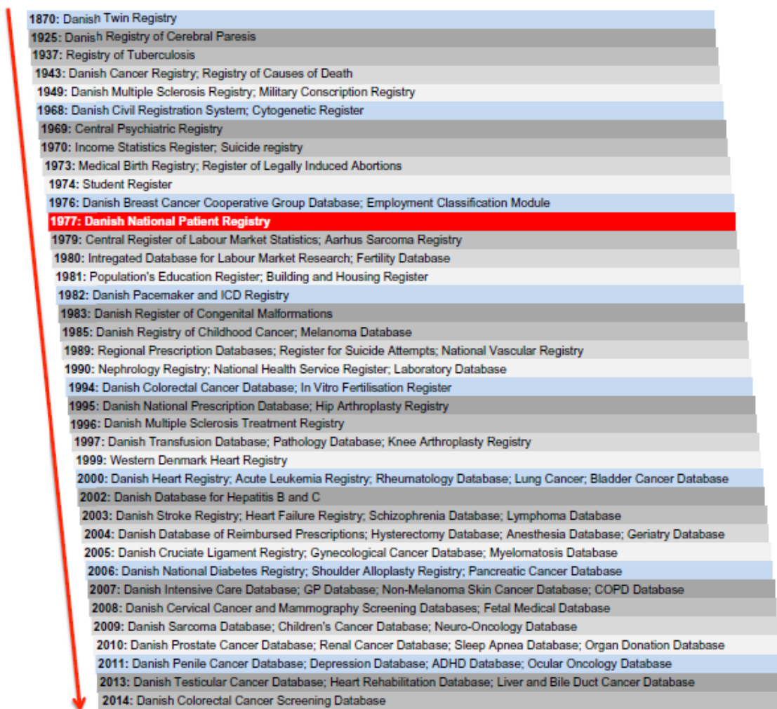
Figure 1: Timeline for the initiation of selected Danish registries linkable to the Danish National Patient Registry (Schmidt, M. et al. 2015).

numerous and comprehensive – even when benchmarking against the high standards of the Nordic countries.